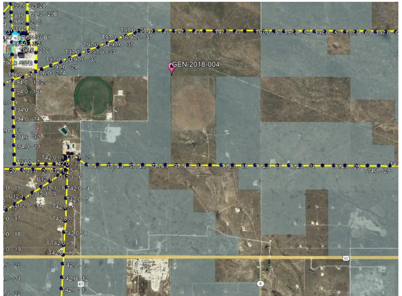
Figure 1 – New McCoy Substation Location